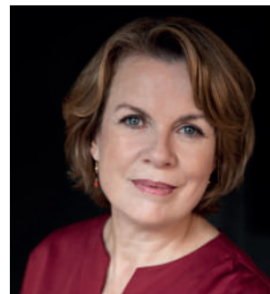
Bernarda Fink Voice