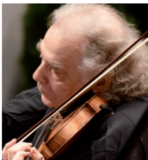
Zakhar Bron Violin